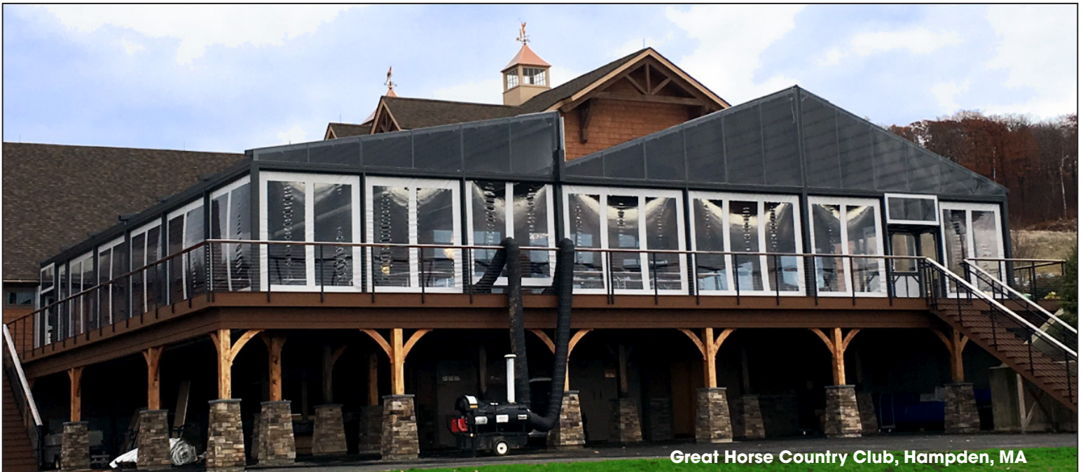
Great Horse Country Club, Hampden, MA