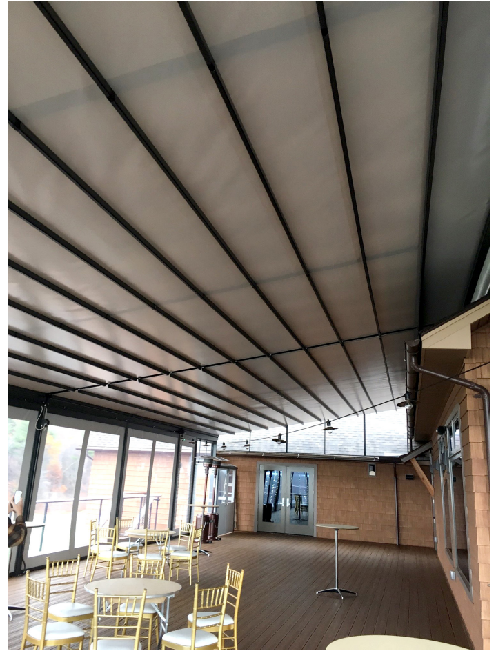
KE Genius® A2C with Custom Support Structure

KE Custom Solutions designed and produced a large, customized framework (what we call a Tempo) to carry two back-to-back Genius® A2C retractable roof units. Custom posts and headers were designed and constructed to be placed along the perimeter to accommodate the side enclosures, completing the all-weather design of this structure. The open span, retractable roof patio cover was ready for hospitality.