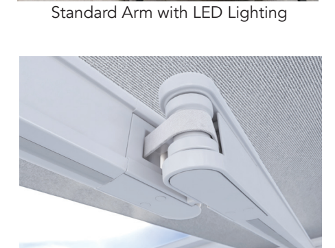
Optional Aki Arm with LED Lights and Hidden Fasteners