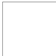
WHITE RAL 9010