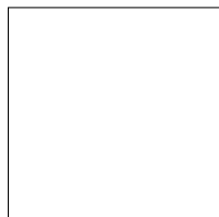
WHITE RAL 9010