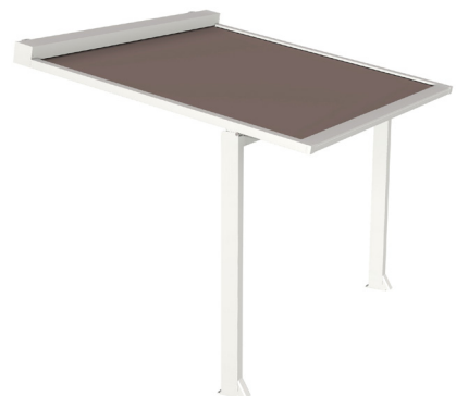
Horizontal (with legs)