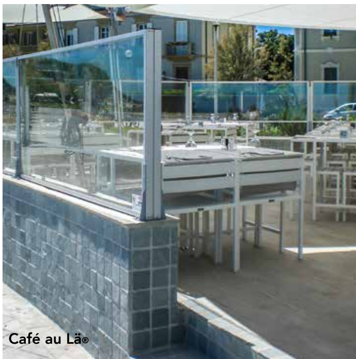
Café au Lä®