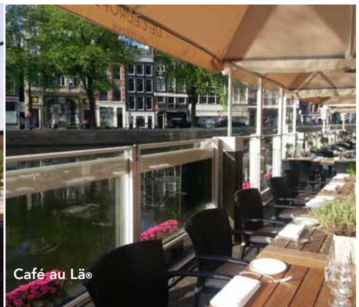
Café au Lää®