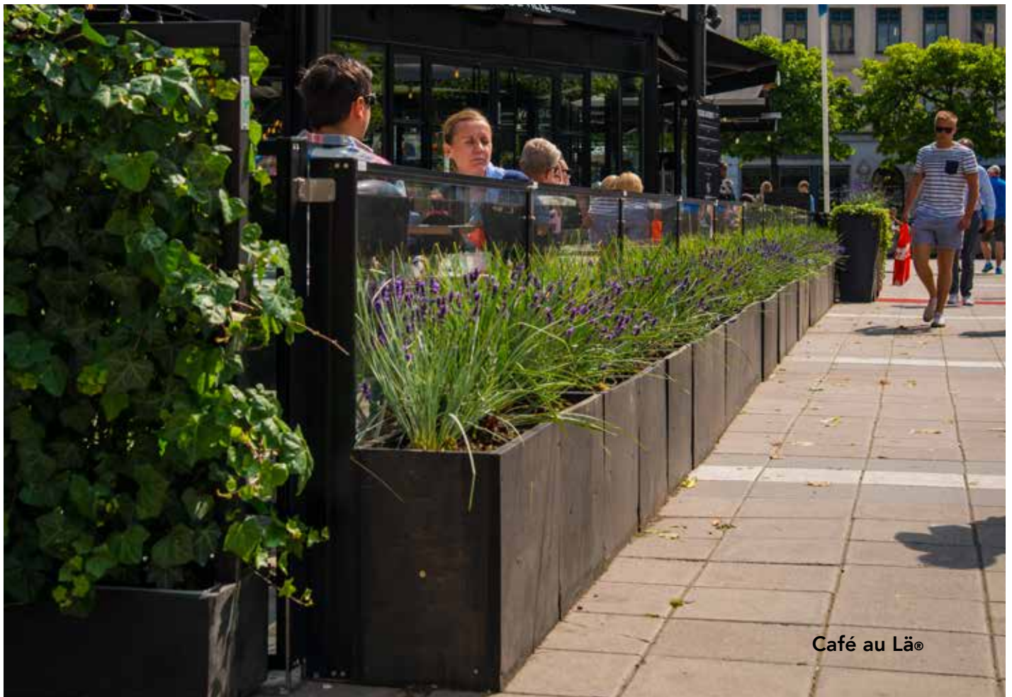
Café au Lä®