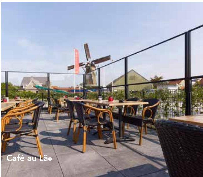
Café au Lää®