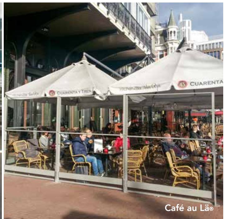
Café au Lä®