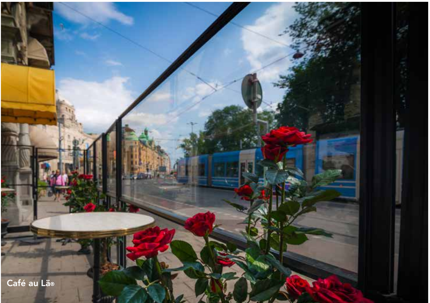
Café au Lää®